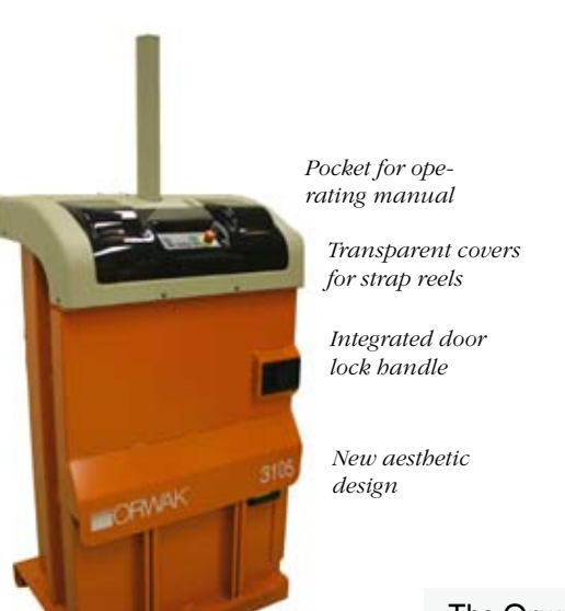
The smallest front loaded baler in the assortment

An autostart function allows the baler to start compacting the material as soon as you close the door.